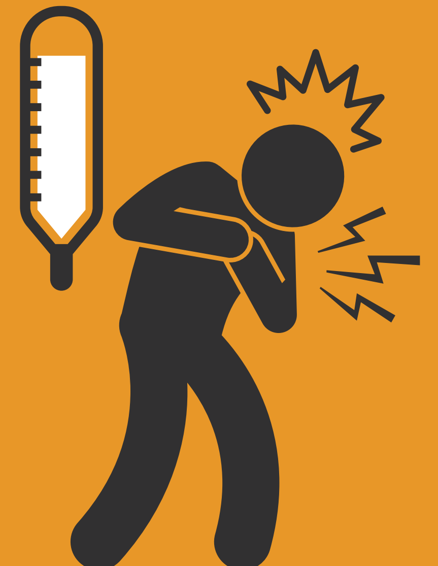
ANY NEW PATIENT RESTARTS PROCESS