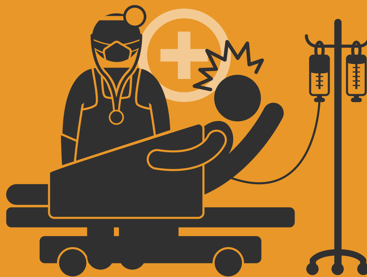
PATIENT INTERVIEW FOR CONTACTS